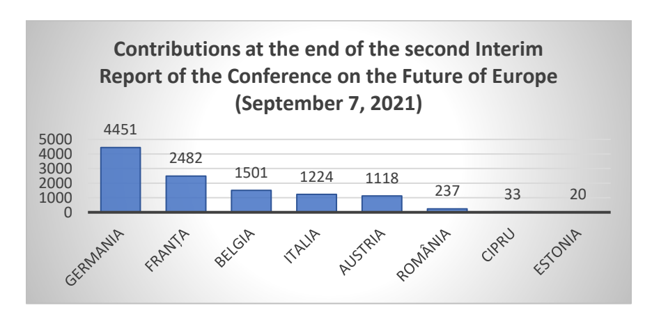
Figure 1: Romania's contributions compared to other states, at the end of the second Interim Report of the Conference on the Future of Europe (September 7, 2021) elaboration of author.

Regarding Romania's contribution, at the end of the first report<sup>16</sup> it counted 160 contributions, and after the second report<sup>17</sup> it counted 237 contributions, ranking 16th, a relatively middle position in the ranking of Member States. However, compared to the first 6 countries in the ranking (Germany, France, Belgium, Italy, Austria, Spain) or compared to the last two (Cyprus and Estonia) the difference is significant, as it is shown in the table below.